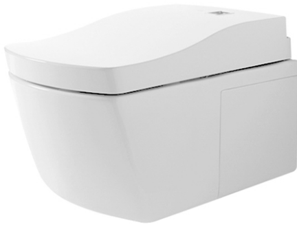
Neorest LE II carrying innovative Actilight Technology